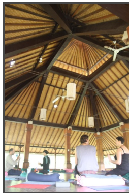
Venue: Melati Cottages