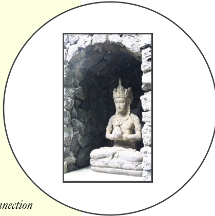
Ancient carving at Tirta Empul